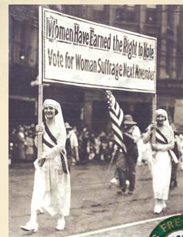
Women marching in suffrage parade, 1917