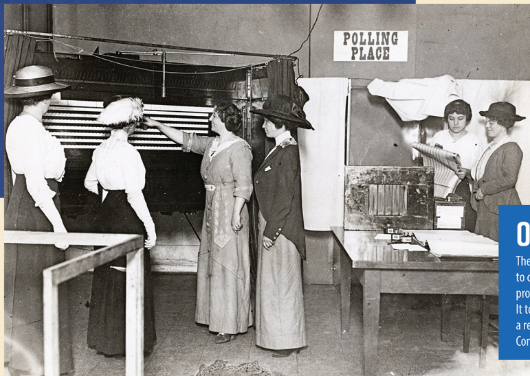
“Learning to use a voting machine,” Chicago, ca. 1915

end of March 1920 only one additional state was needed for ratification. On August 18, 1920, after calling a special session of the state legislature, Tennessee became the 36th state to ratify the 19th Amendment.