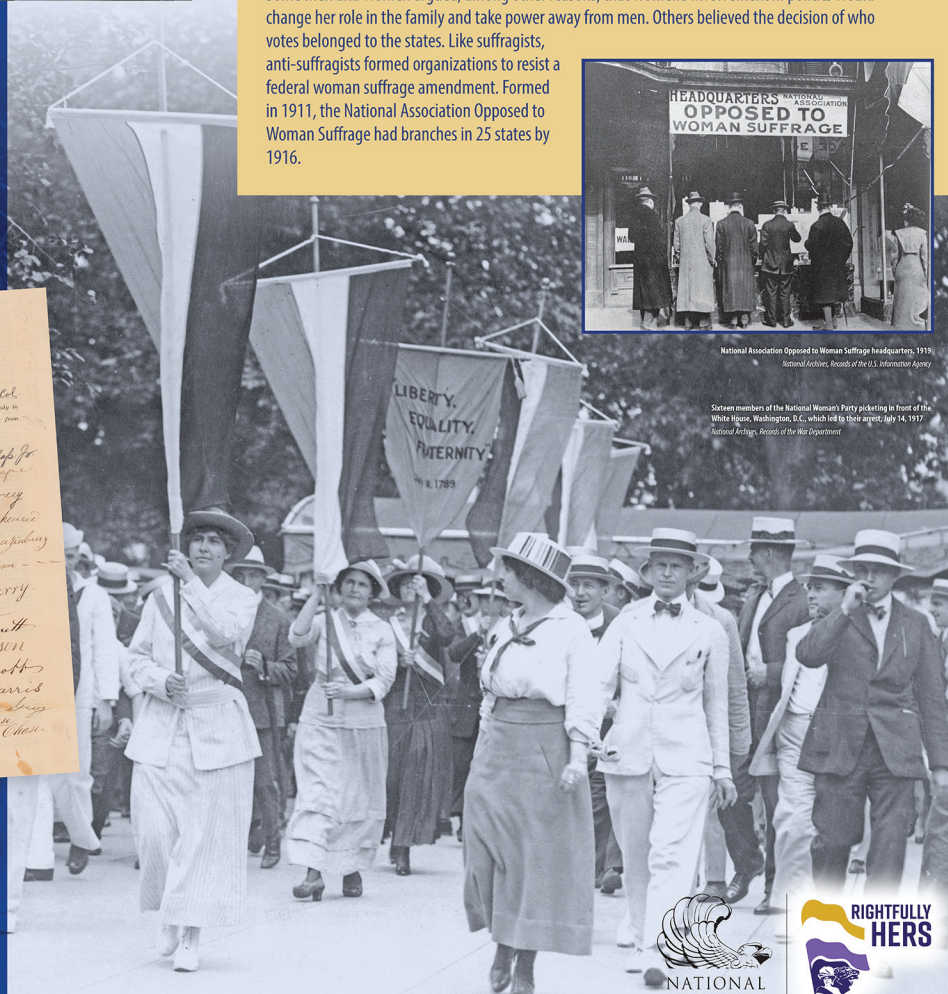
Sixteen members of the National Woman's Party picketing in front of the White House, Washington, D.C., which led to their arrest, July 14, 1917