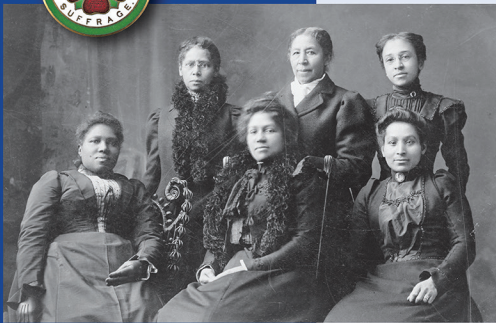
African American Women's League group, Newport, Rhode Island, ca. 1911