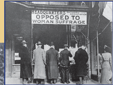
National Association Opposed to Woman Suffrage headquarters, 1919

Some men and women argued, among other reasons, that women's involvement in politics would change her role in the family and take power away from men. Others believed the decision of who votes belonged to the states. Like suffragists, anti-suffragists formed organizations to resist a federal woman suffrage amendment. Formed in 1911, the National Association Opposed to Woman Suffrage had branches in 25 states by 1916.