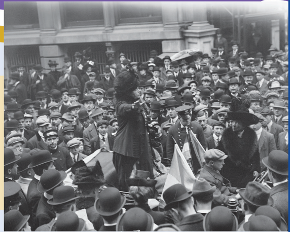
Harriet Stanton Blotch speaking on Wall Street, 1910

Over time these tactics won support for woman suffrage that led to the ratification of the 19th Amendment to the U.S. Constitution in 1920.