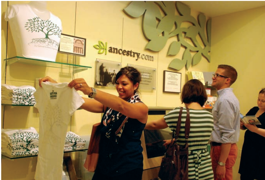
The myArchives Store specializes in merchandise based on the records of the National Archives. Proceeds support the Archives' educational programming.

Despite a government closure and building construction, the myArchives Store continued to expand its reach, launching a new e-store and earning a "Best for History Buffs" recommendation from Washingtonian magazine.