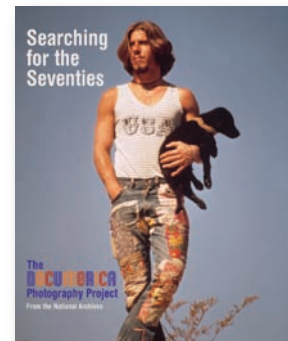
"Searching for the Seventies" exhibition catalog.

The Foundation also worked with co-publisher Giles Ltd. to publish a photography book in support of "Searching for the Seventies."