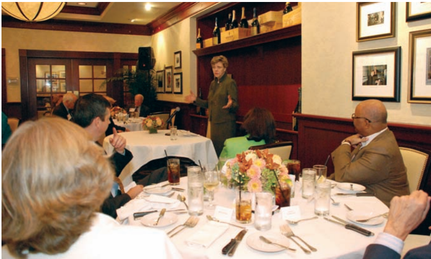
ABOVE: Cokie Roberts entertains Signers Circle members at a private luncheon. RIGHT: Young Founders Society members enjoy photo booth during tour of "Searching for the Seventies."