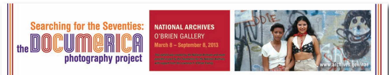
ABOVE: Metrorail and Metrobus ads promote "Records of Rights" and "Searching for the Seventies" exhibits.