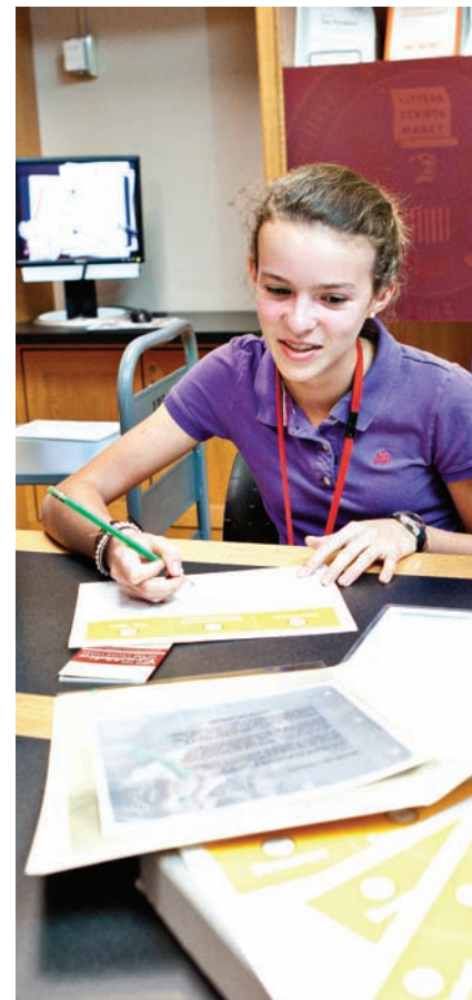
Student “archivists” explore records in the Boeing Learning Center.