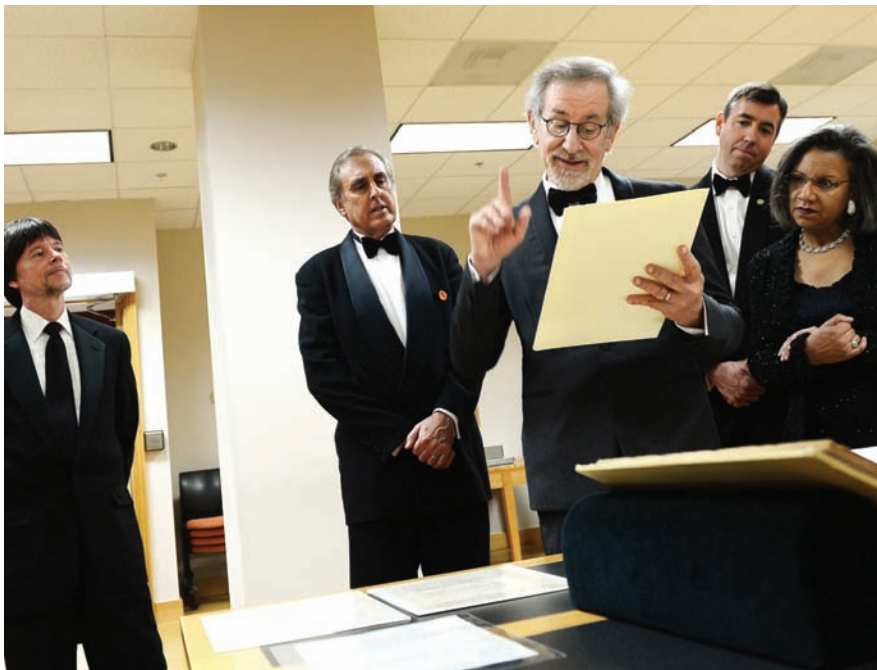
Gala honoree Steven Spielberg reads from an 1861 record during a private tour before the festivities.