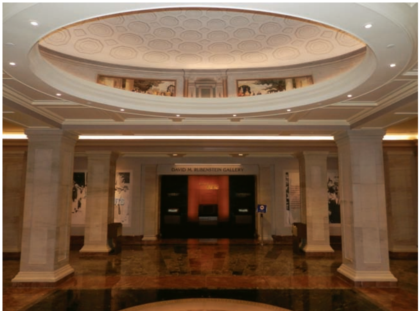
Orientation Plaza ceiling hints at the Rotunda, located one floor above the entrance.

The new Orientation Plaza leading to the Rubenstein Gallery now serves as a gathering place for museum visitors, who can begin their visit in the gallery, then continue to the exhibitions on the second floor—including the Rotunda, the “Public Vaults,” and the Lawrence F. O’Brien Gallery—as well as to the Boeing Learning Center and the William G. McGowan Theater. The ceiling of the Orientation Plaza includes a trompe l’oeil painting of the Archives Rotunda, giving the illusion of looking directly up into the room that holds the original Declaration of Independence, the U.S. Constitution, and the Bill of Rights. The Orientation Plaza also features a short film on eight video screens that tells the story of the National Archives’ mission, collection, locations, and activities.