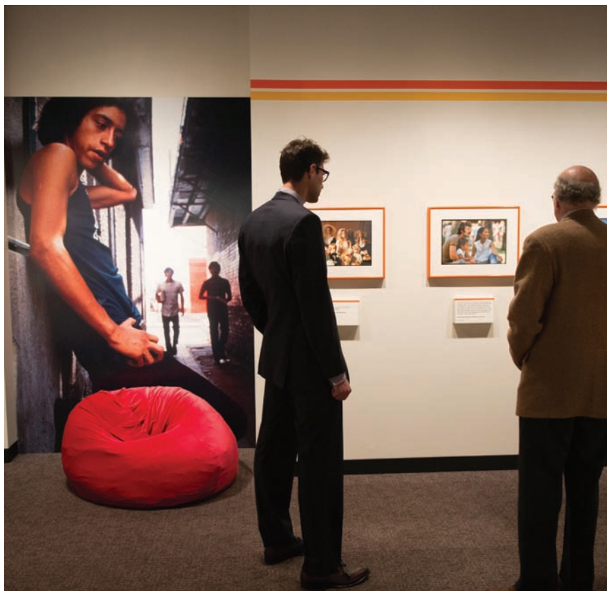
Visitors explore '70s photos at exhibit opening.