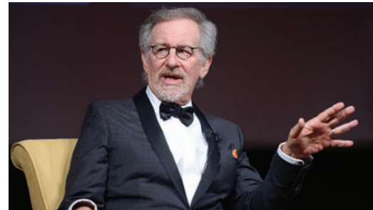
Steven Spielberg discusses his film influences during the Gala program.