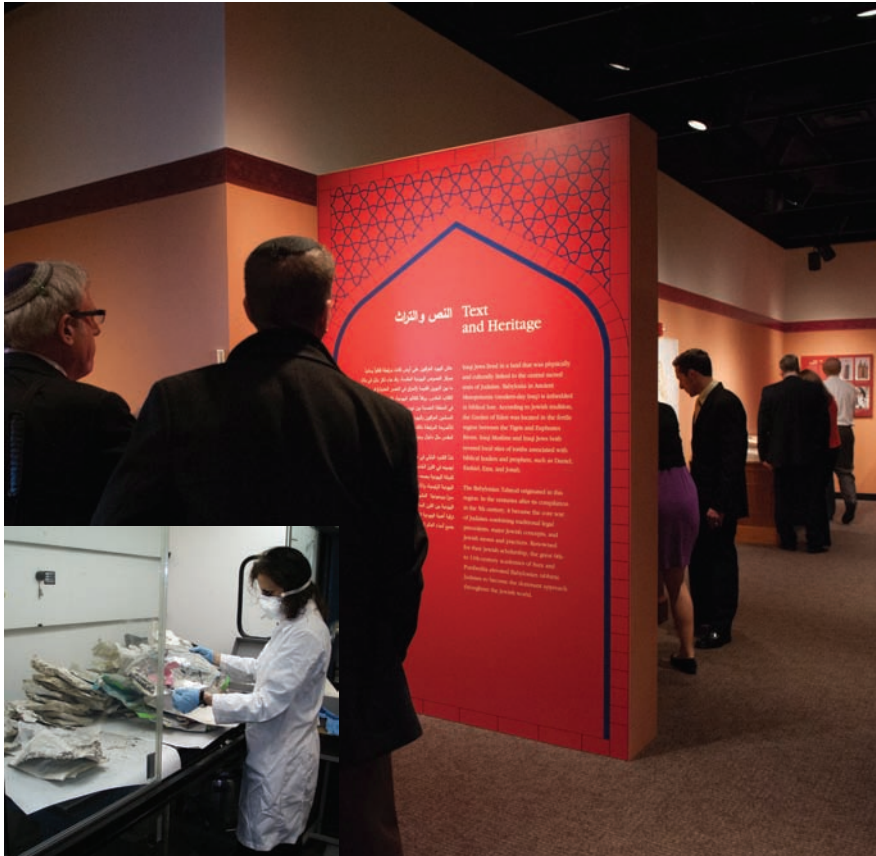
National Archives staff recovered and salvaged many damaged documents from Baghdad (inset) and prepared them for exhibit in "Discovery and Recovery."

In the spring of 2003, just days after the invasion of Baghdad, 16 American soldiers assigned to search for nuclear, biological, and chemical weapons entered Saddam Hussein's intelligence building. In the basement, under four feet of water, they found thousands of books and documents relating to the Jewish community of Iraq – materials that had come from synagogues and Jewish organizations in Baghdad. "Discovery and Recovery" featured the dramatic recovery of these records in Iraq and documented the National Archives' ongoing work in support of U.S. Government efforts to preserve them for future generations. The records were made available online at ija.archives.gov through the assistance of the U.S. Department of State, the National Endowment for the Humanities, and the Center for Jewish History.