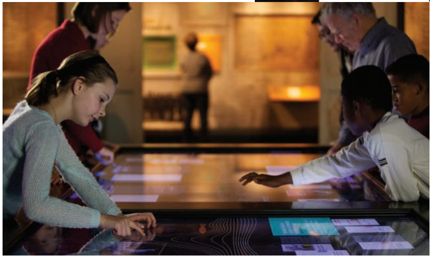
Visitors try out “Records of Rights” interactive table.