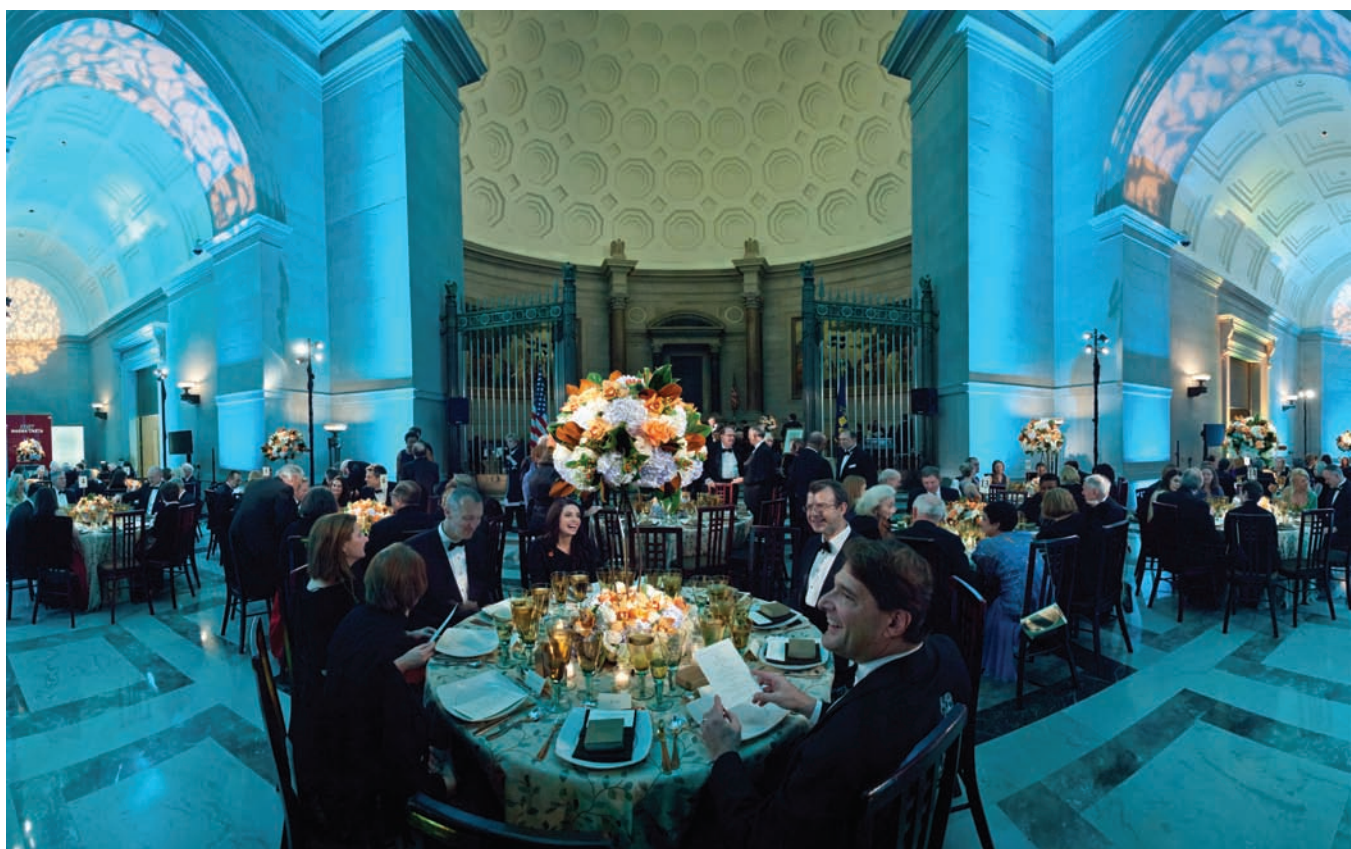
Guests enjoy dinner in the Rotunda Galleries.

The Foundation named director Steven Spielberg the recipient of its 2013 Records of Achievement Award in recognition of his film legacy, which has brought to life defining moments of our nation's history.