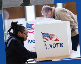
People vote in the Virginia primary at Centerville High School in Centerville, Virginia, March 1, 2016