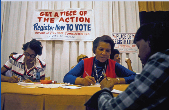
Voter Registration Drive, October 1973